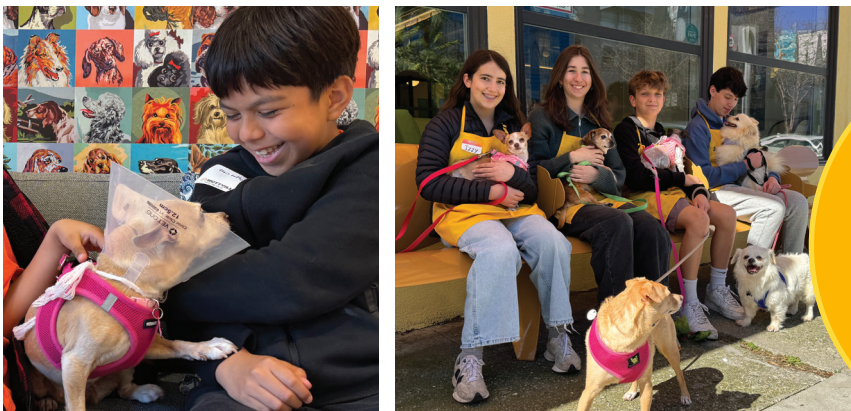
A 2025 survey of students in Muttville's Humane Education program found that they developed a sense of empathy and compassion for the dogs and learned how their efforts can make a positive difference in the dogs' lives.

Through connecting with the mutts, kids learn compassion, patience, and the joy of helping others. They write stories inspired by the mutts and make adoption posters to help them find homes – beaming with pride in the difference they're making.